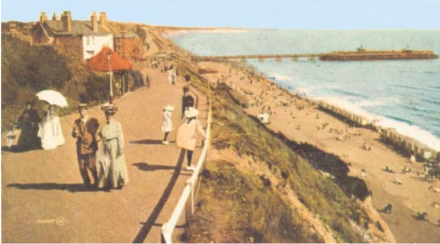
Bournemouth from West Cliff