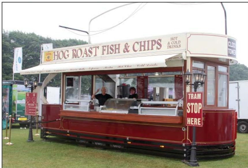
Fully Restored and Converted Blackpool Tram

Catering For All Main Events To The Highest Standard