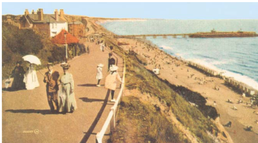
Bournemouth from West Cliff