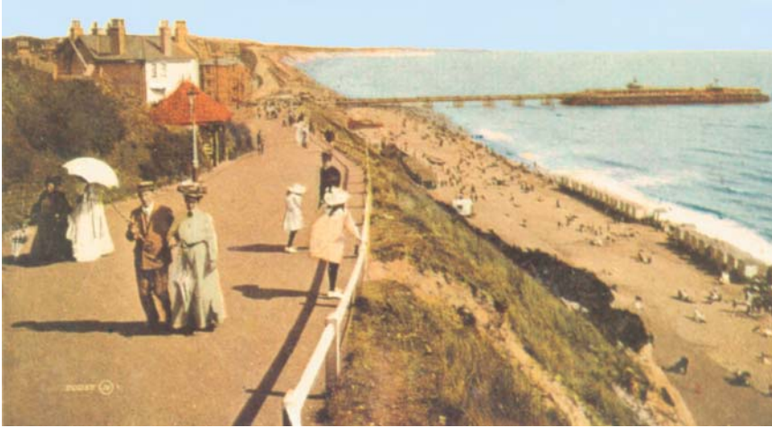
Bournemouth from West Cliff

BEST SPECIAL BEGINNER IN SHOW (New this Year)